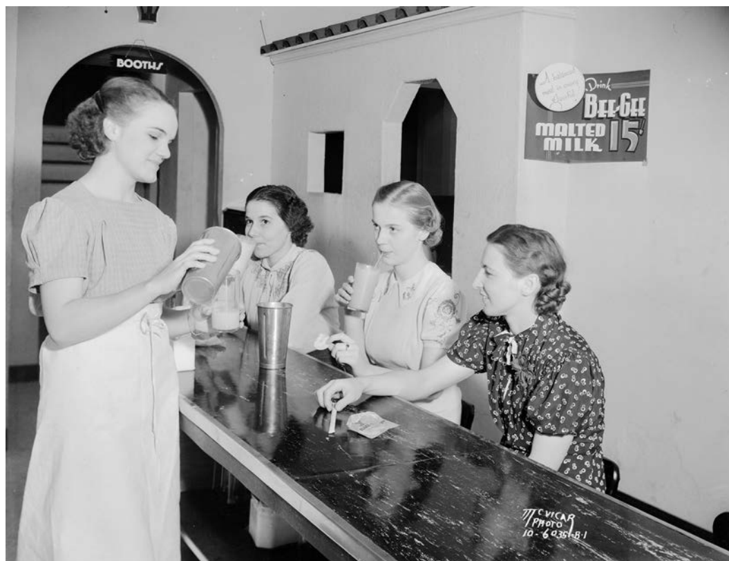
A soda jerk pours a malt into a glass as three women sit at the counter of McCoy's Ice Cream Parlor, located at 507 State Street.