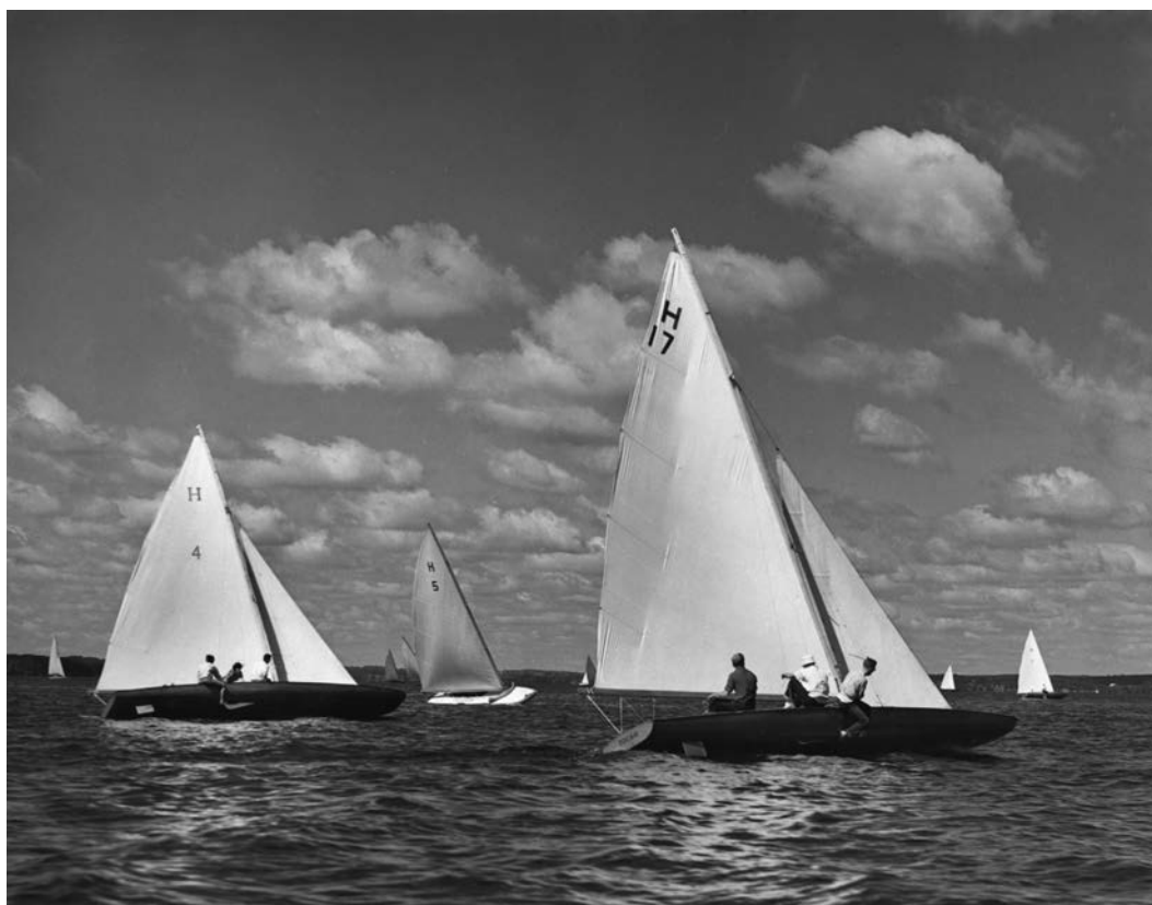
A sailboat race on Lake Mendota.

Session Type: Lightning Talk LIVESTREAM MASKS REQUIRED