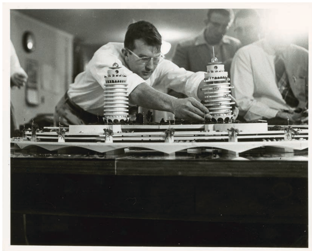
An architect sets a tower on an architectural model of Monona Terrace.