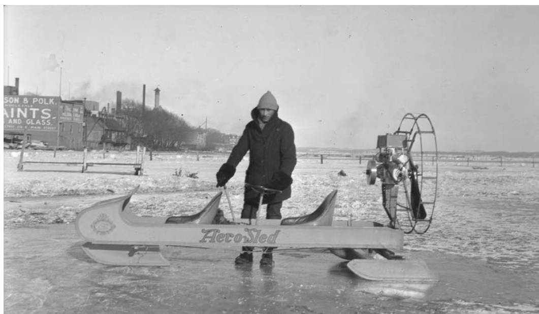
A man dressed in winter clothes is standing behind an Aero-Sled iceboat, which has a motor and a propeller on the back. The boat is near the Lake Monona shoreline. In the background is the Jackson and Polk Paints store at 218 East Main Street.