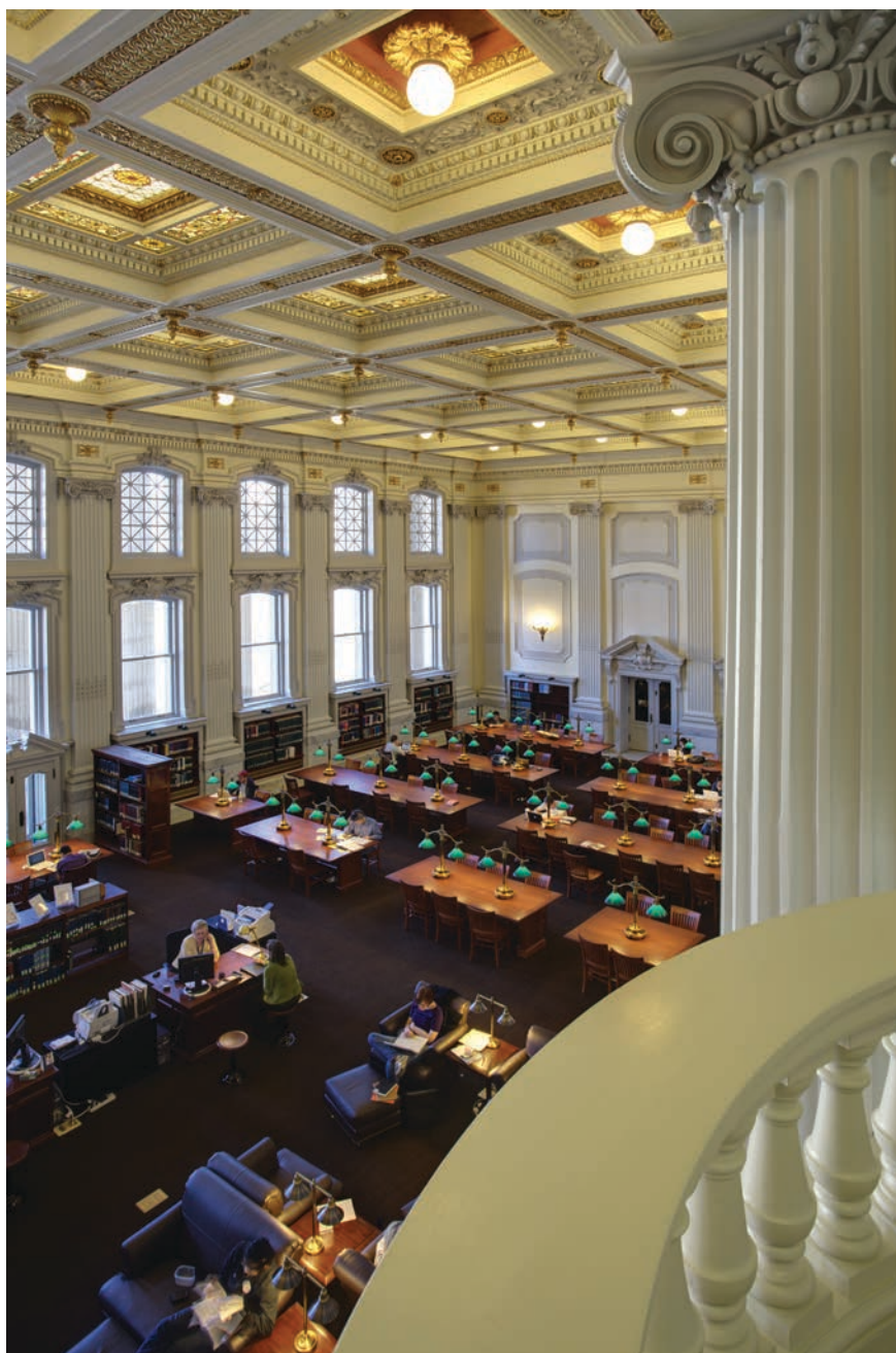
View of the reading room at the Wisconsin Historical Society.