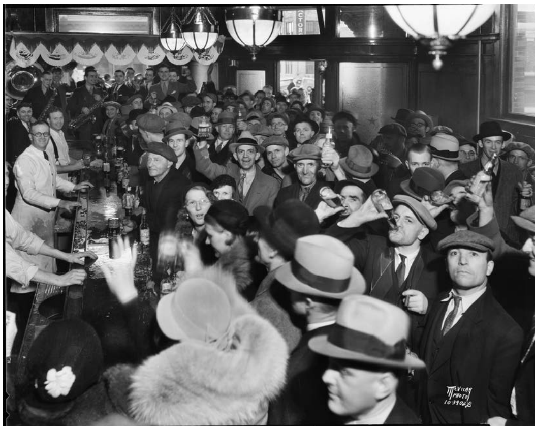
Slightly elevated view of crowd in the Fauerbach Brewery tavern at 651 Williamson Street, with men and women drinking and toasting and celebrating the end of Prohibition. A small band plays in the background. Wisconsin Historical Society, Image ID 3493.

Session Type: Roundtable Discussion MASKS REQUIRED