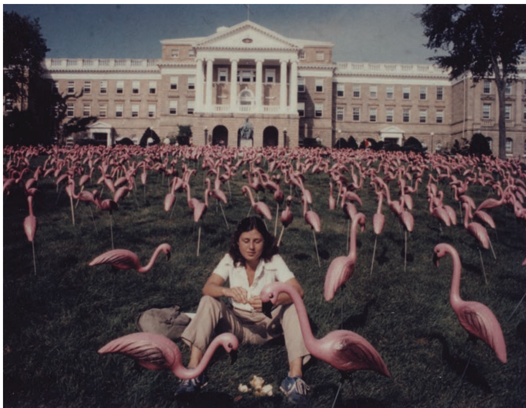
View uphill toward a woman sitting among a flock of pink flamingo lawn ornaments covering Bascom Hill. She is pretending to feed bread to two pink flamingos in front of her. Bascom Hall and the Abraham Lincoln statue are in the background.