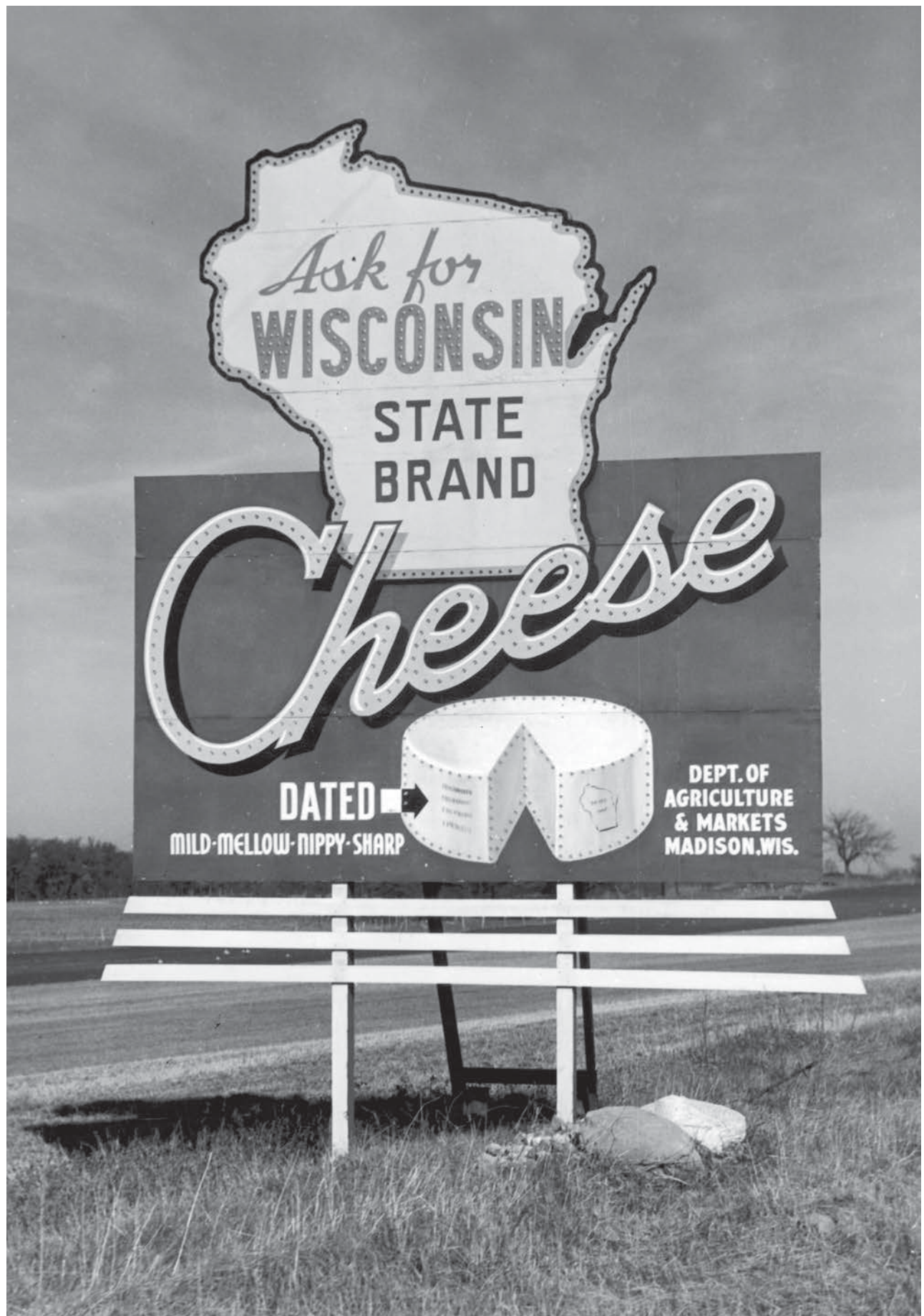
Highway billboard advertising Wisconsin cheese for the Department of Agriculture and Markets.