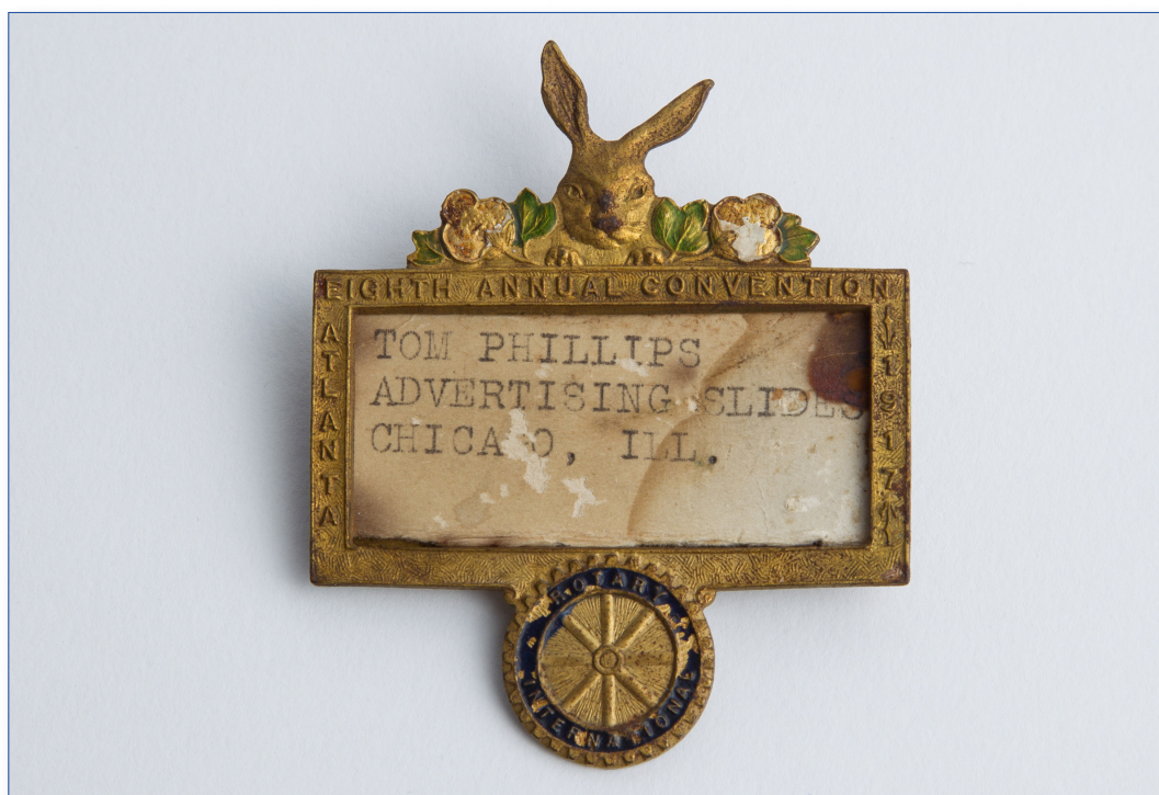
Name badge of a Chicago Rotarian who attended the 1917 Rotary convention in Atlanta, Georgia.