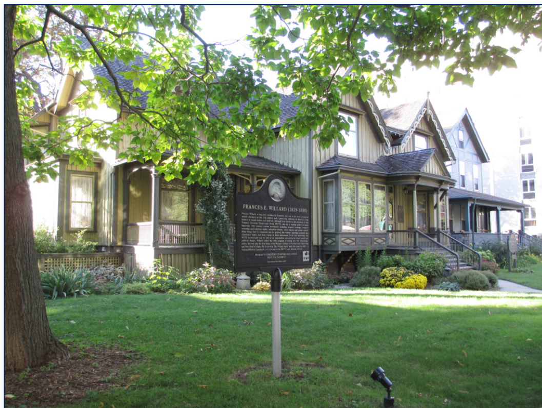
The home of Frances E. Willard—activist, reformer, and founding member of the Woman's Christian Temperance Union—is open to researchers in Evanston. Frances Willard House Museum and Archives.