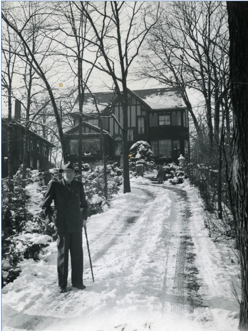
Paul Harris, founder of Rotary, in front of his home on Longwood Drive on the South Side of Chicago in December 1942.