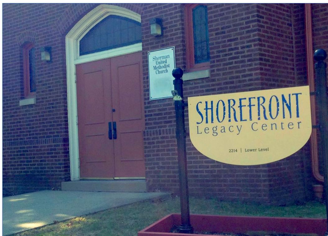
The Shorefront Legacy Center documents Black life and culture on Chicago’s suburban North Shore.