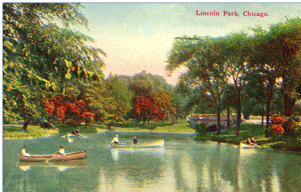
Boaters enjoy Chicago's Lincoln Park Lagoon.