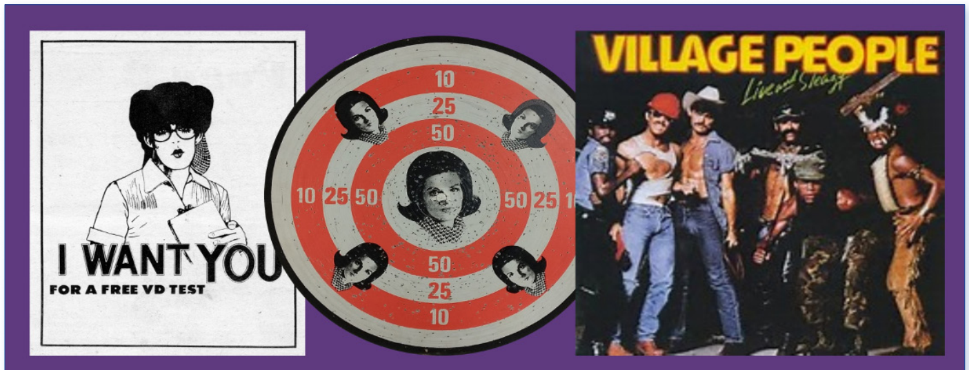
Artifacts and records at the Gerber/Hart Library and Archives document a vibrant LGBTQ history and culture.

At 11:00 a.m., take a tour of the Leather Archives and Museum , which is dedicated to the compilation, preservation, and maintenance of leather, kink, and fetish lifestyles. The museum galleries present educational and historical materials to an adult audience, and the reading library and archives support researchers and community members in accessing materials and documentation relevant to the history and culture of leather ( leatherarchives.org ; 6418 North Greenview Avenue, Chicago).