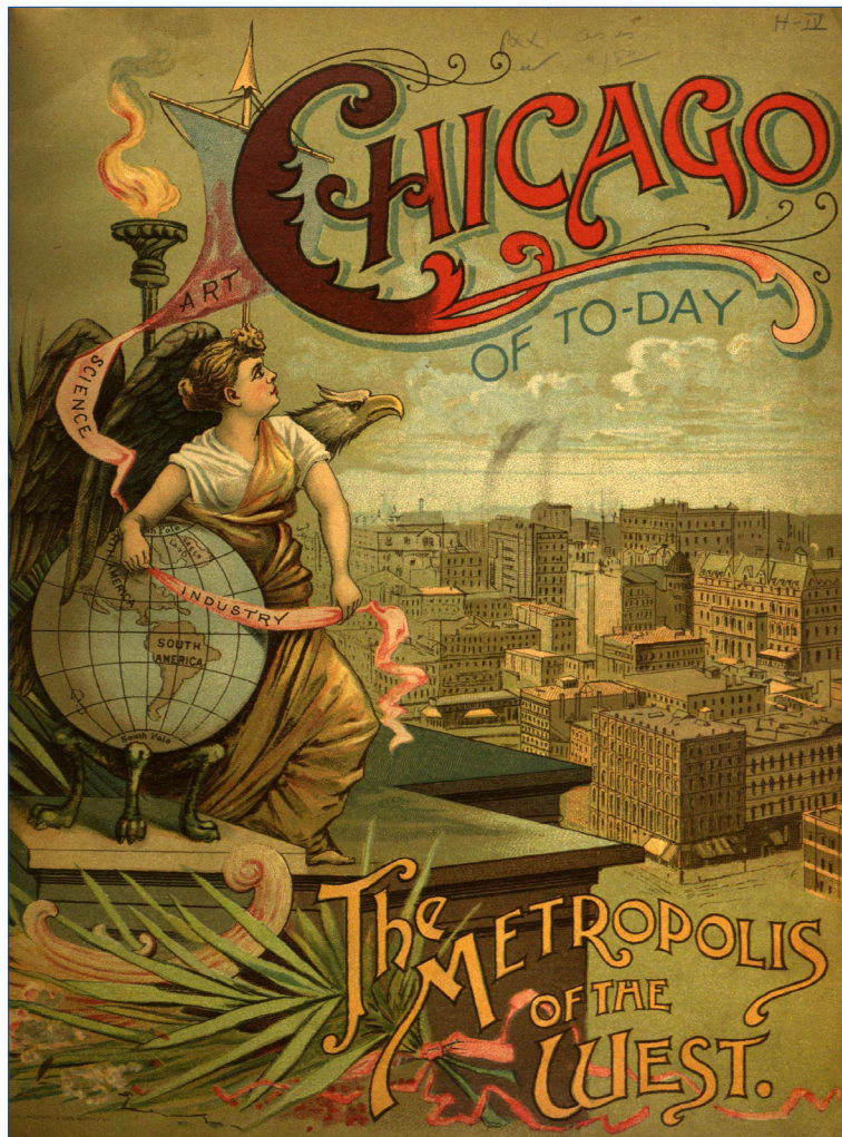
City boosters promoted Chicago as the "mighty city of the prairies" and its many amenities as host of the 1893 World's Columbian Exposition.

Within walking distance of hotel; also accessible via public transportation ( https://www.newberry.org/60 W. Walton Street, Chicago ).