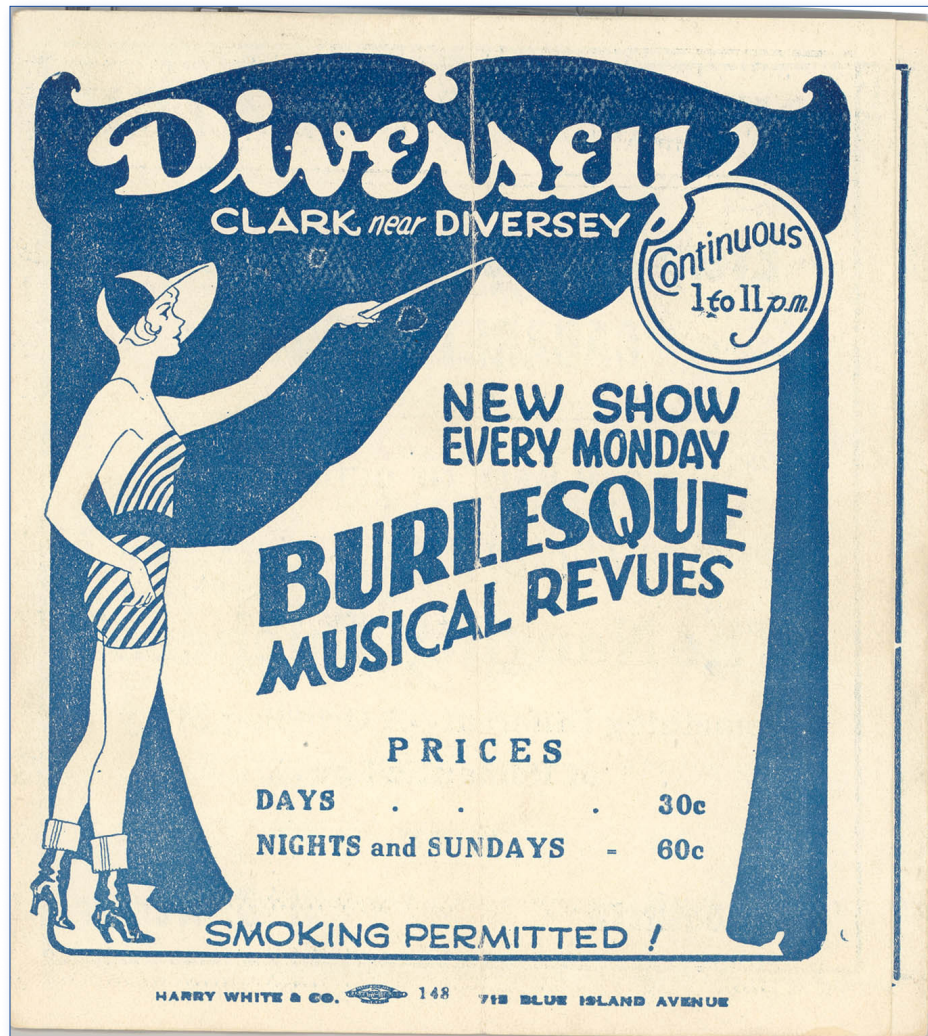
Visitors to Chicago have never lacked for entertainment, as this racy advertisement, c. 1920, shows.

Don't miss the many excellent dining experiences in Chicago. City natives and transplants will guide you to the most interesting flavors in the area. Participants will walk to downtown restaurants. Sign up at the registration desk.