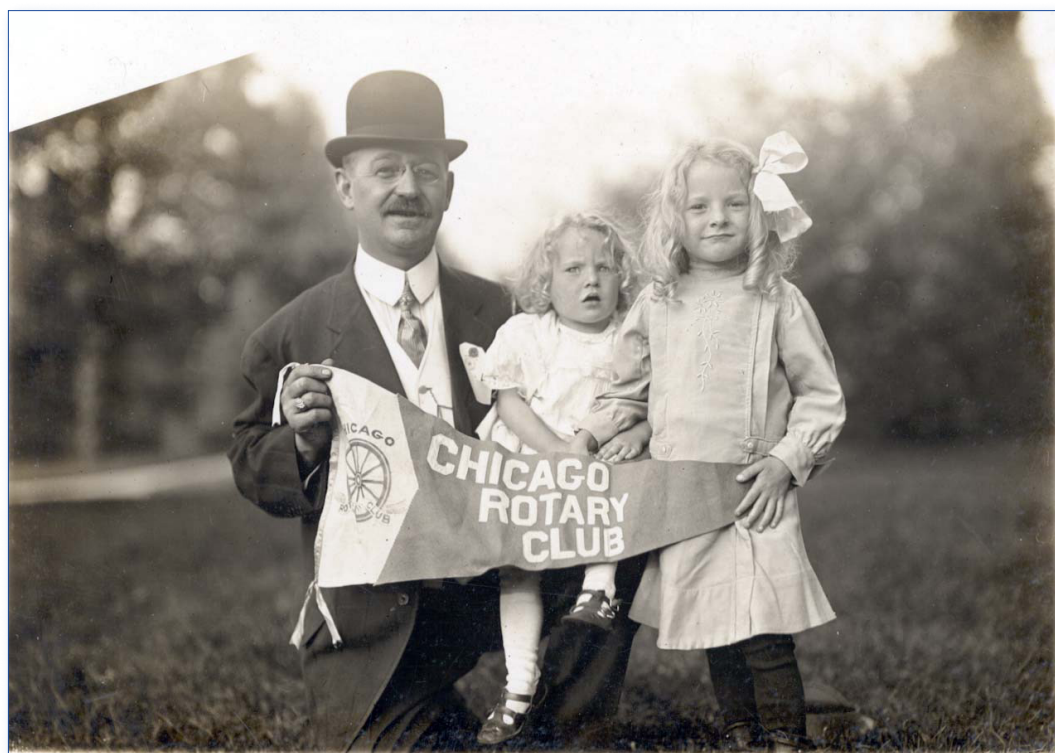
A Rotary Club of Chicago "outing" at Jackson Park in Chicago on September 10, 1910.