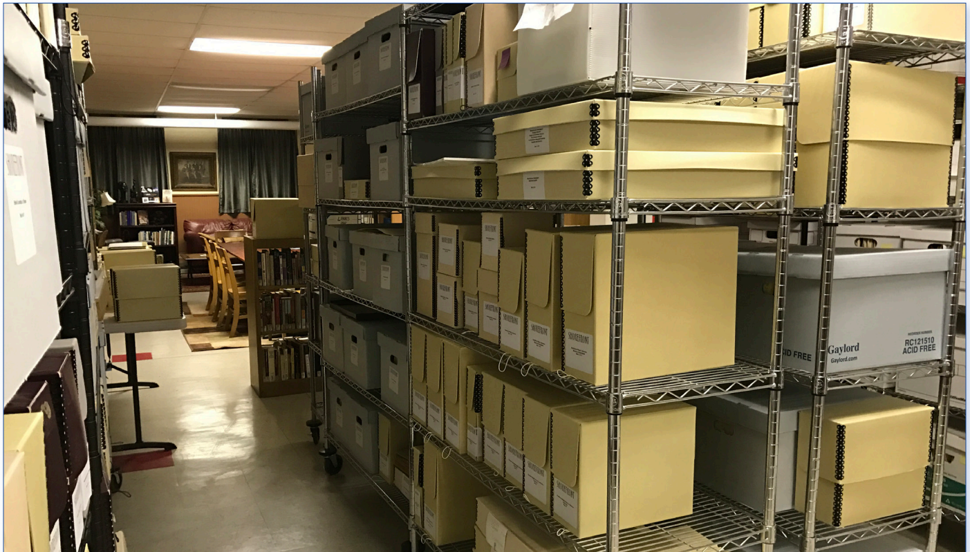
Collections at the Shorefront Legacy Center document black life and culture on Chicago's suburban North Shore.

Location: Club 8 at Symphony Center, 220 S. Michigan Avenue, Chicago