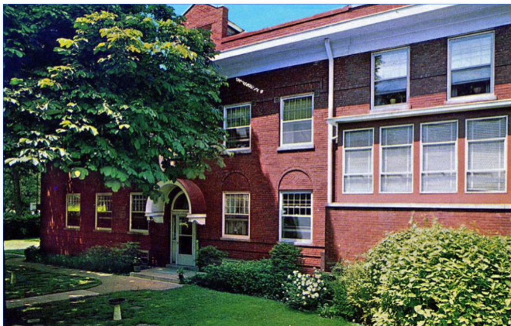
A contemporary view of the Woman's Christian Temperance Union administration building, founded in 1874.