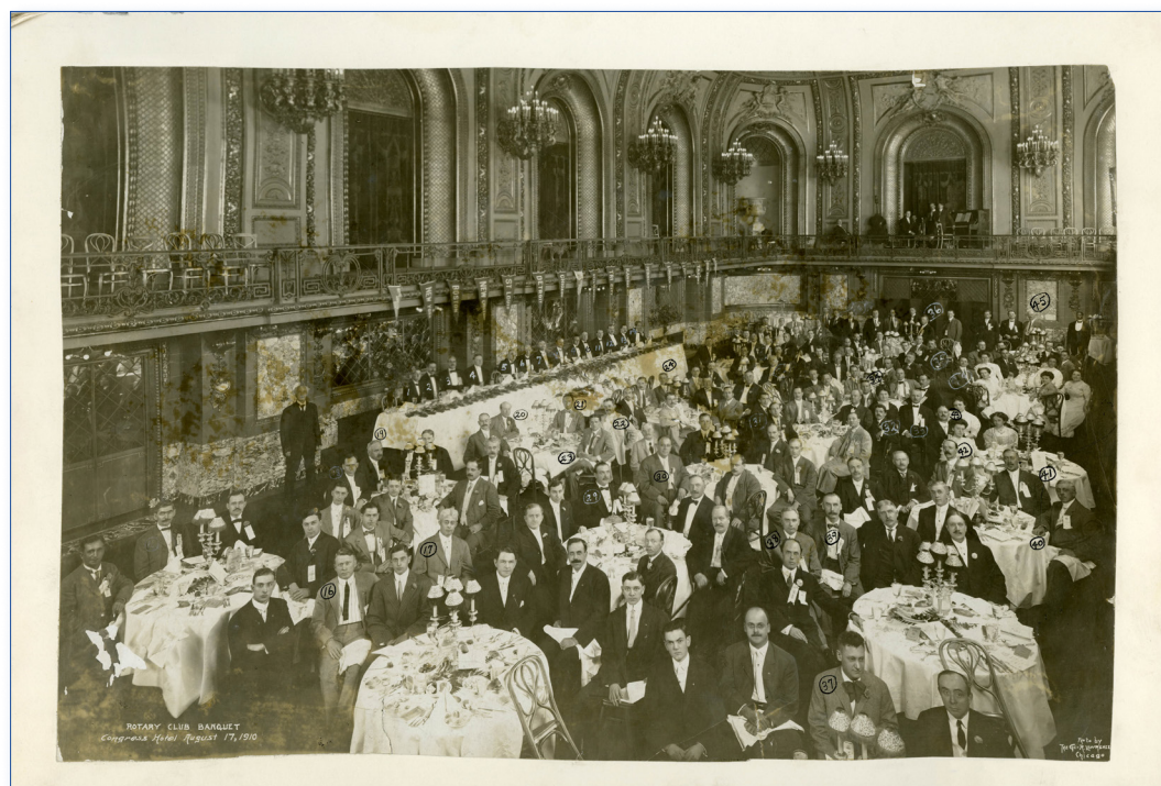
Banquet at the Congress Hotel in Chicago during the 1910 Rotary convention.