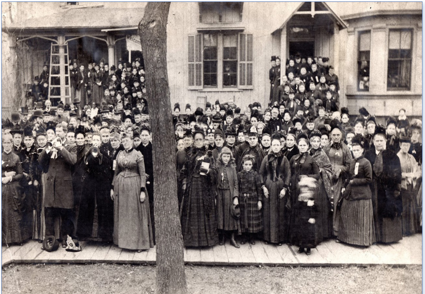
Members of the Woman's Christian Temperance Union gather in front of Willard House during a national convention, c. 1895.

Discover one of Chicago's beautiful and historic suburbs in this "tour crawl"! Evanston has a number of impressive archival repositories, three of which you will visit on this tour. For more than 110 years, Rotary International members have been addressing challenges around the world. Tour Rotary International's global business archives and learn how Heritage Communications leverages historic assets to tell Rotary's story, including its 30-year effort to end polio. Next, you'll visit the historic house of a world-famous social reformer and the archives of the largest women's organization in the nineteenth century: the Frances Willard House Museum and Archives has it all! The tour will include reformer Frances Willard's recently restored historic home and the adjacent Woman's Christian Temperance Union (WCTU) Administration Building, which houses Willard's papers and the extensive records of the WCTU's long, international history. The tour will conclude with a visit to the Shorefront Legacy Center . Shorefront collects, preserves, and educates people about African American history on Chicago's suburban North Shore. Encompassing seven suburban communities, Shorefront has built a repository documenting the over 150-year presence of its black population. Don't miss this opportunity to get behind the scenes in Evanston! Transportation will be provided.