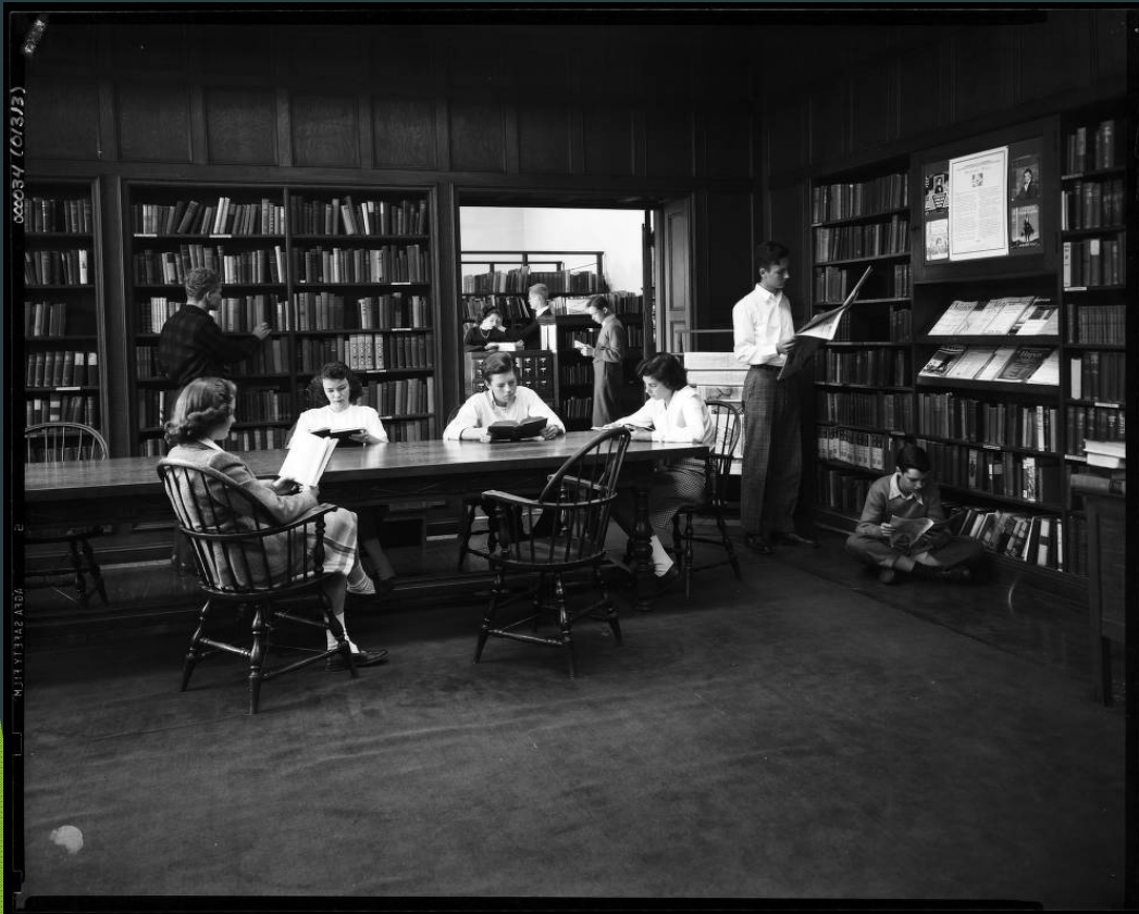
John Burroughs School, Library, St. Louis, 34-1313