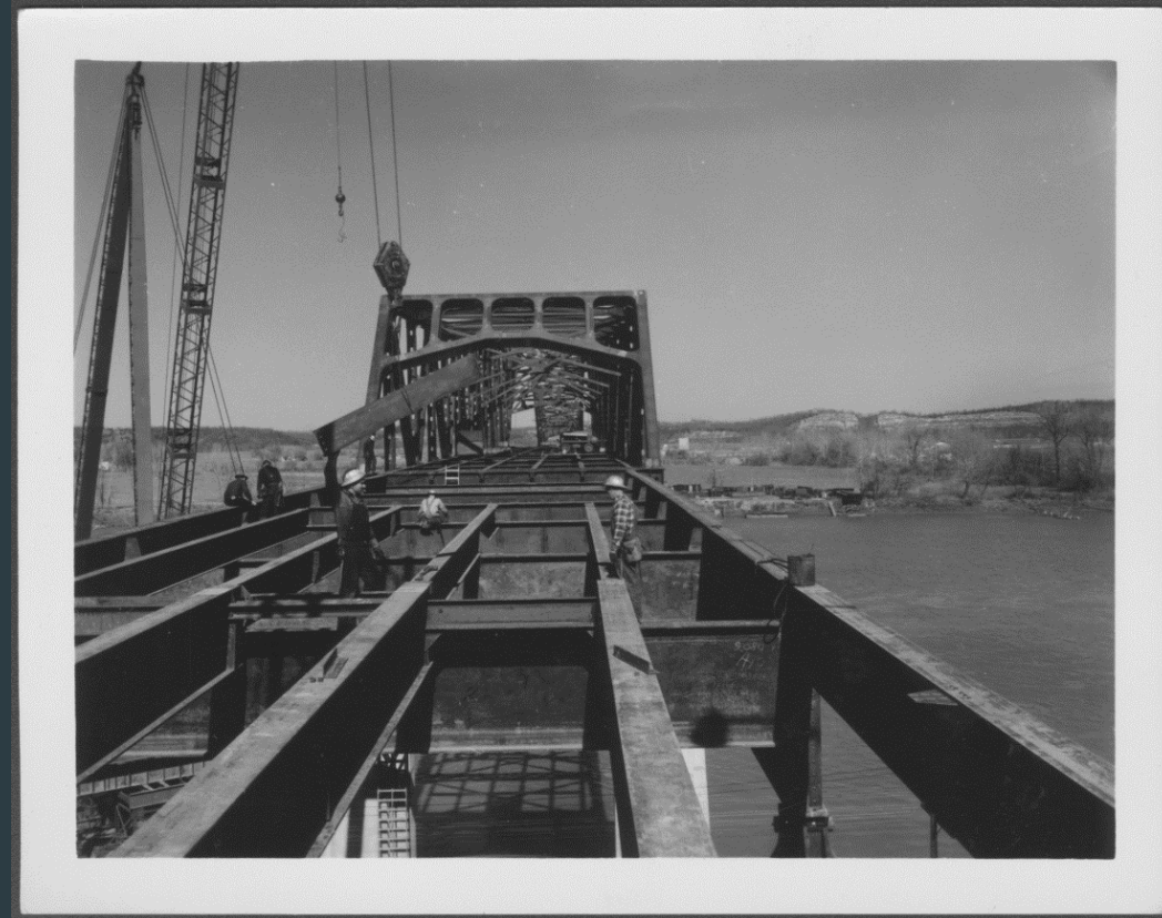
Jefferson City Bridge, 2-140