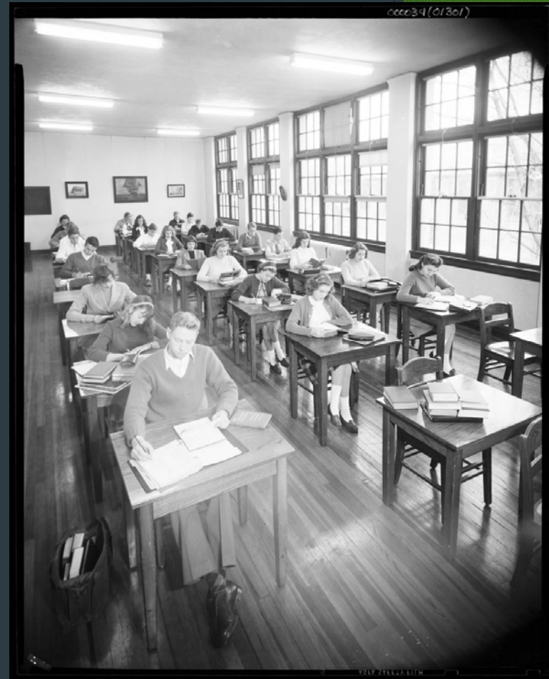
John Burroughs School, Classroom.