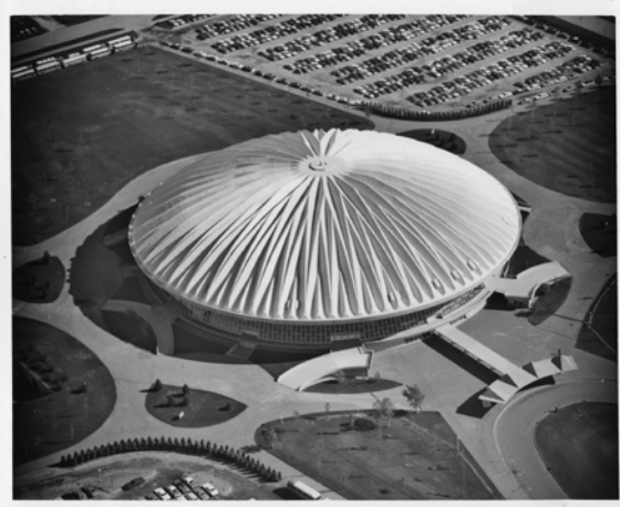
University of Illinois Assembly Hall Champaign, IL 1963