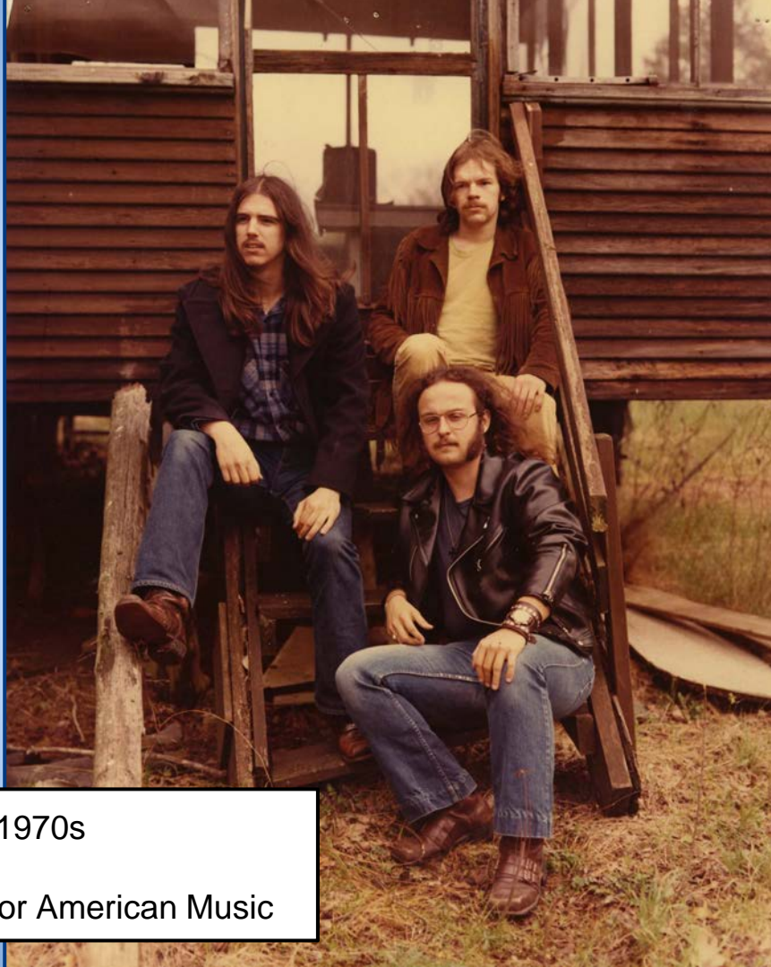
Members of “Gibraltar”, circa 1970s